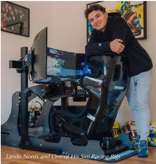
Lando Norris and One of His Sim Racing Rigs

racing. And you don't have to spend millions of dollars on a state-of-the-art simulator to get started. You can get started with only a few hundred dollars. And have a lot of fun.