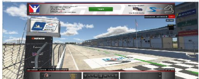
iRacing Simulation Software Screen – Corvette C6.R at Sebring

Select high-quality simulation software that offers realistic physics, car models, and tracks: