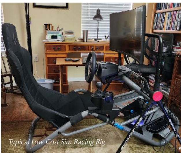
Typical Low-Cost Sim Racing Rig

Sim Racing is an exhilarating hobby that combines the thrill of motorsport with the convenience of home gaming. For many enthusiasts/potential racers, it provides a