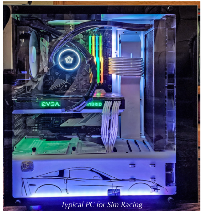
Typical PC for Sim Racing

The foundation of your sim racing setup is a moderately powerful and reliable PC. If you do not have an existing PC and need to buy or build one, here are the key components you'll need: