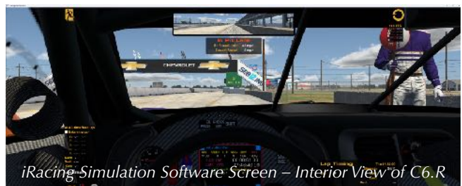
iRacing Simulation Software Screen – Interior View of C6.R