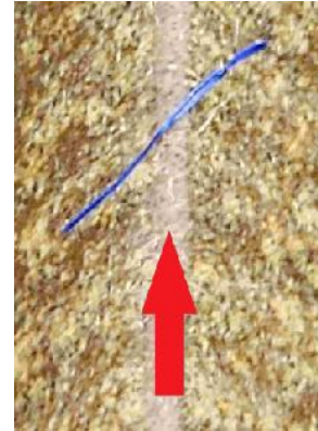
Figure 9 – Blue Foreign Material – Non-Metallic

I found some unexpected glitter in the first filter I opened. When I stretched out the filter media pleats, I immediately spotted a couple sparkly particles of what looked like metallic particles. They were all silver so most likely aluminum or steel. There were no brass or copper-colored particles (valve guides). I also saw a blue thread-like material in the media pleats. I let the filter media drain overnight on paper towels with hopes that more glitter would be visible.