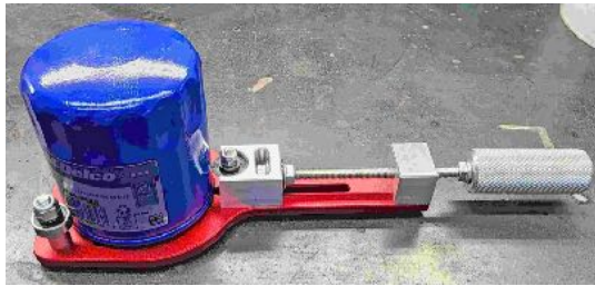
Figure 2 – Filter and Cutter