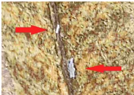
Figure 7 – Foreign Particles – Magnetic