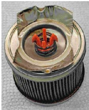
Figure 4 – Filter Cartridge with Media Pleats