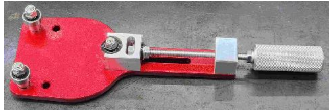
Figure 1 – Filter Cutter

tools for cutting open a filter without creating metal shavings. See Figure 1.