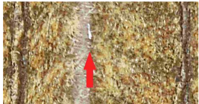
Figure 10 – Foreign Particle - Magnetic