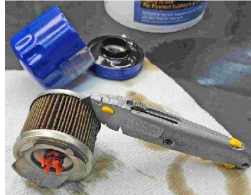
Figure 5 – Cutting the Media Pleats From the Cartridge

holding the filter with. Don't say I did not warn you.