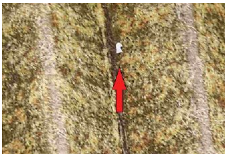
Figure 8 – Foreign Particle - Magnetic