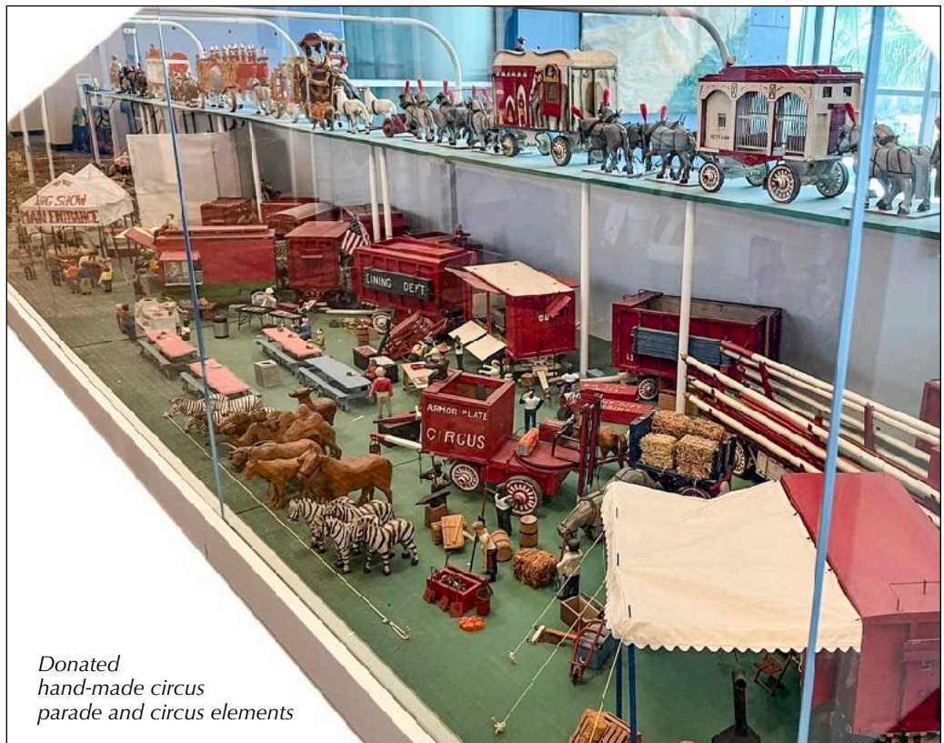
Donated hand-made circus parade and circus elements