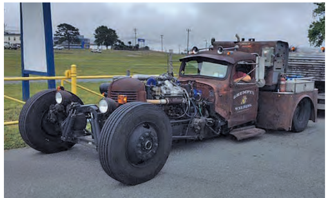
Words cannot explain this one-of-a-kind custom-built machine driven on the Hot Rod Power Tour.

Day 7: Wow, how time flies. There is no week that goes by faster than a Hot Rod Power Tour week! We headed out early in the morning on a beautiful sunny day to Summit Motorsports