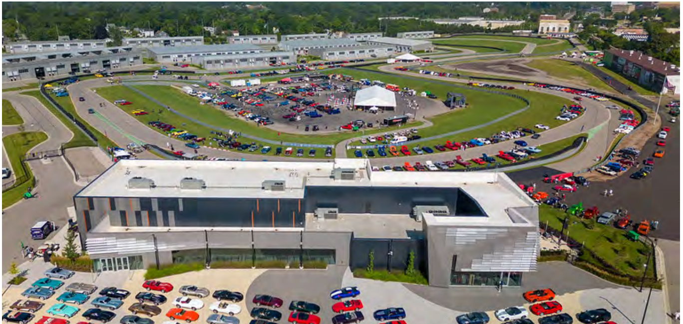
M1 Concours in Pontiac Michigan