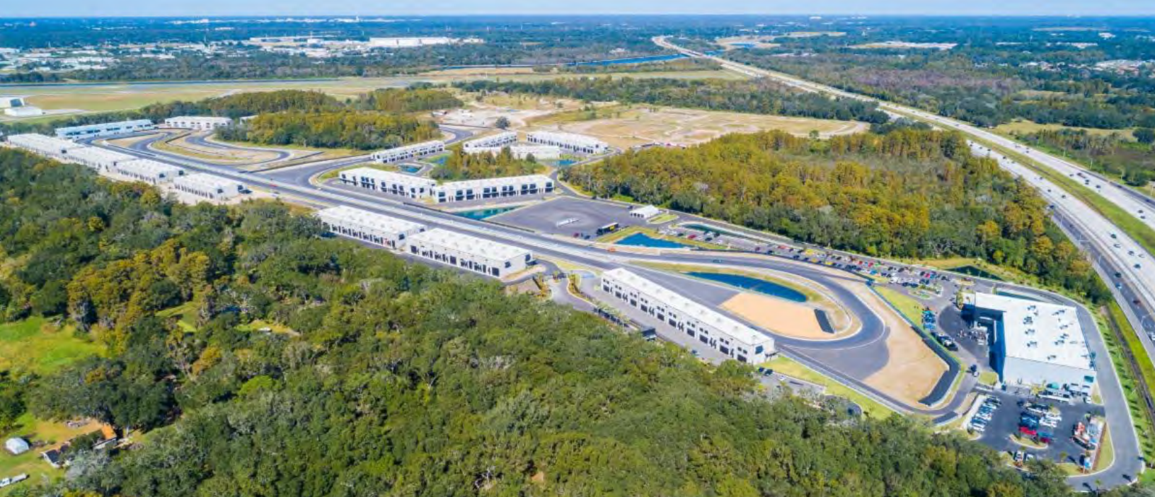
The Motor Enclave